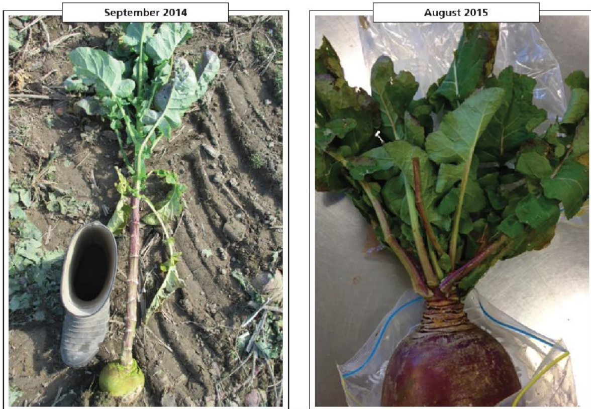
Figure 2. Comparison of swede physical appearance: mid September 2014 and late August 2015.

Analyses of swede plant samples indicated significant differences in GSL concentrations between different plant parts and between HT ® and non-HT ® swede varieties (Figure 3), with significant interactions between plant part and variety. For all plant parts, except bulb/crown, the average glucosinolate concentration was greater in HT ® than non-HT ® swedes. In non-HT ® swedes the bulb/crown and lower leaf GSL concentrations were similar, but there was a steady increase in GSL concentration moving up the plant from lower stem, upper leaf, and upper stem to the flower. In HT ® swedes, there was an increase from bulb/crown, but upper leaf, upper stem and flower were similar for GSL concentrations.